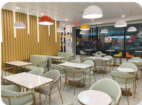
New York Ithaca